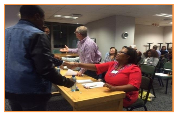
Great Debate Judges